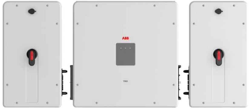
ABB string inverters TRIO-60.0-TL-OUTD-US 60 kW